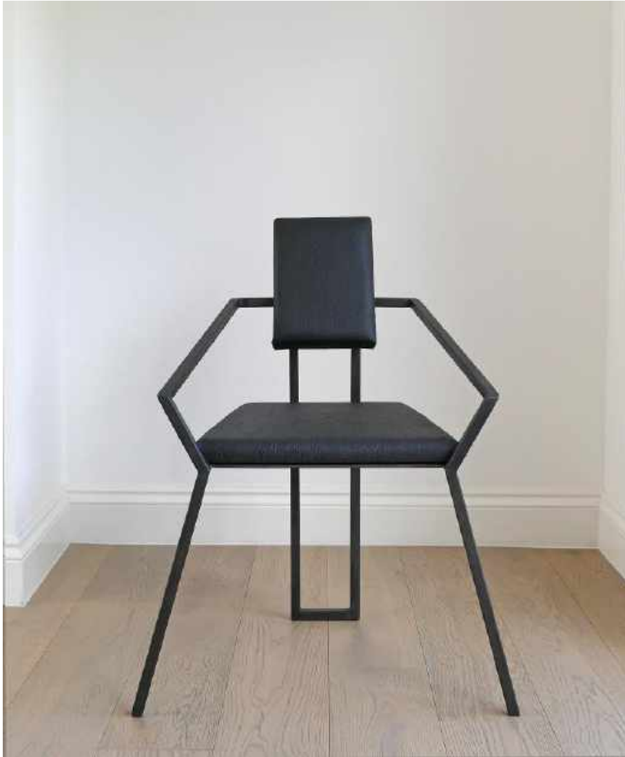
By Tashamine Osher