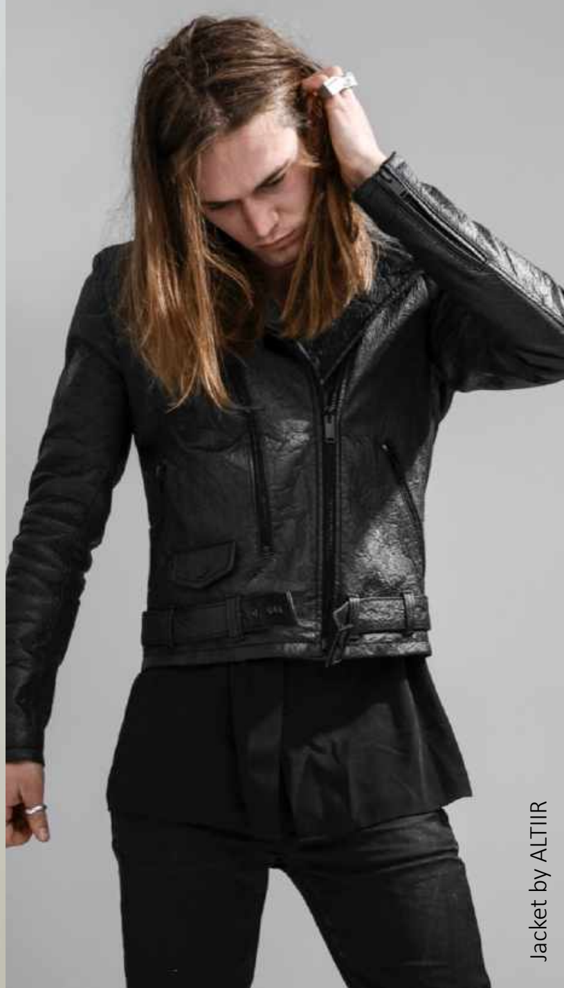
Jacket by ALTIIR