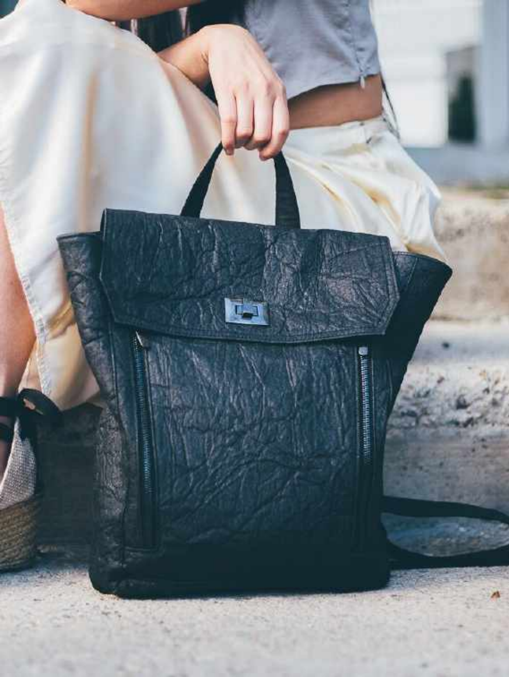
Bag by MANIWALA