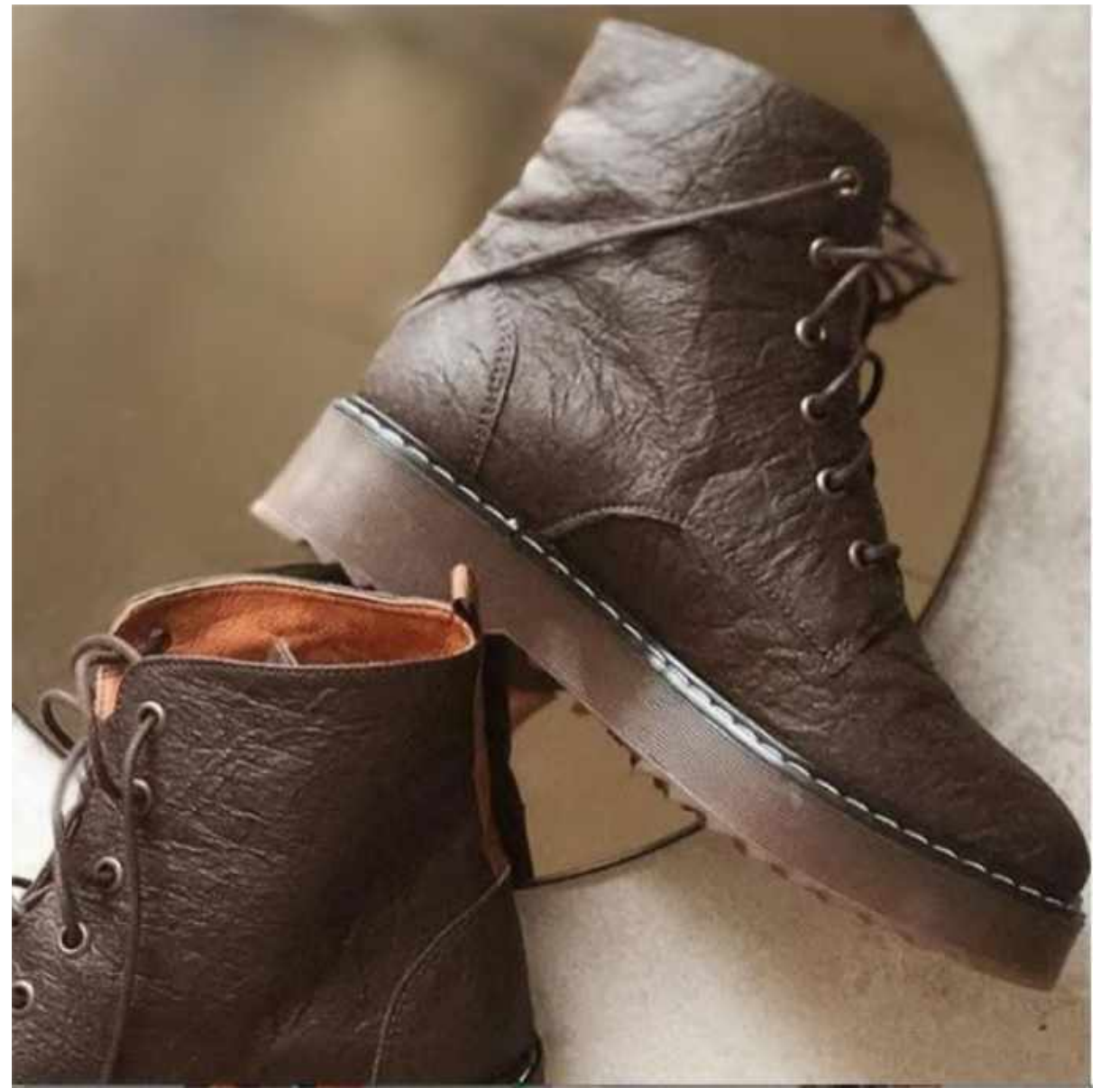
Shoes by Nae Vegan