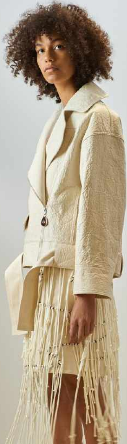
Jacket by EDUN