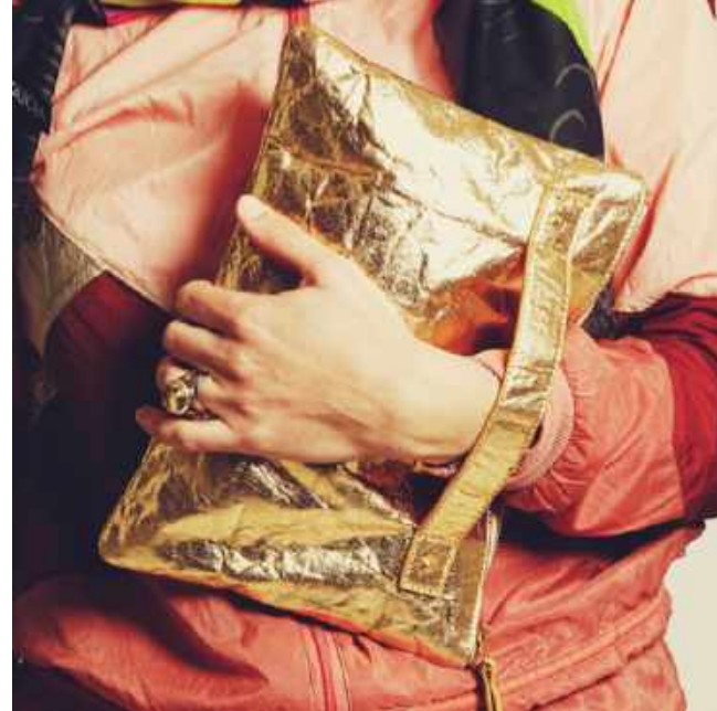
Clutch by TAIKKA