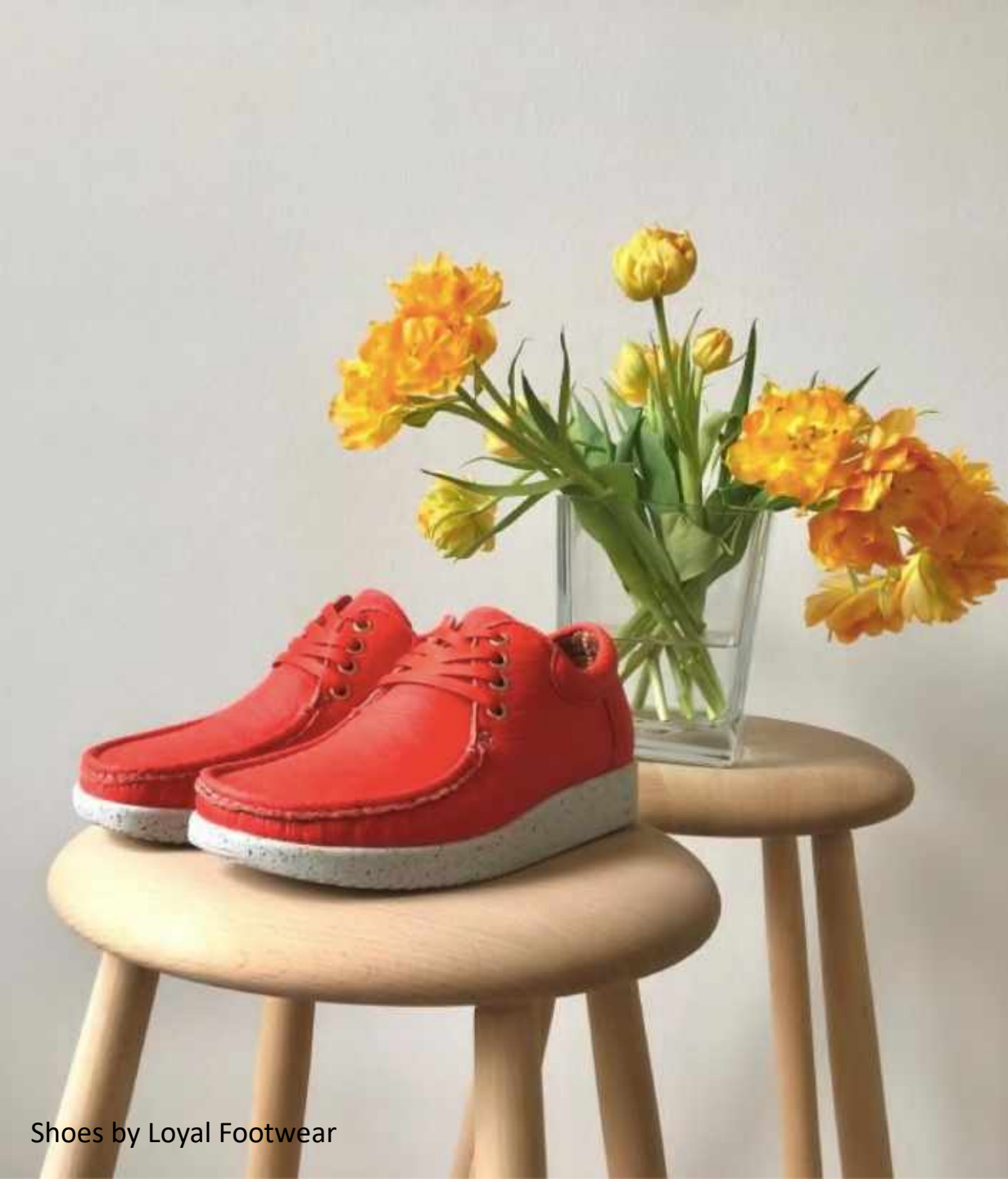
Shoes by Loyal Footwear