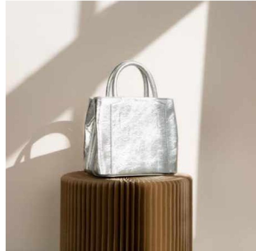
Bag by Luxtra