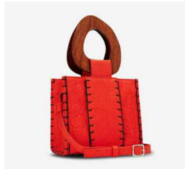
Bag by EDUN