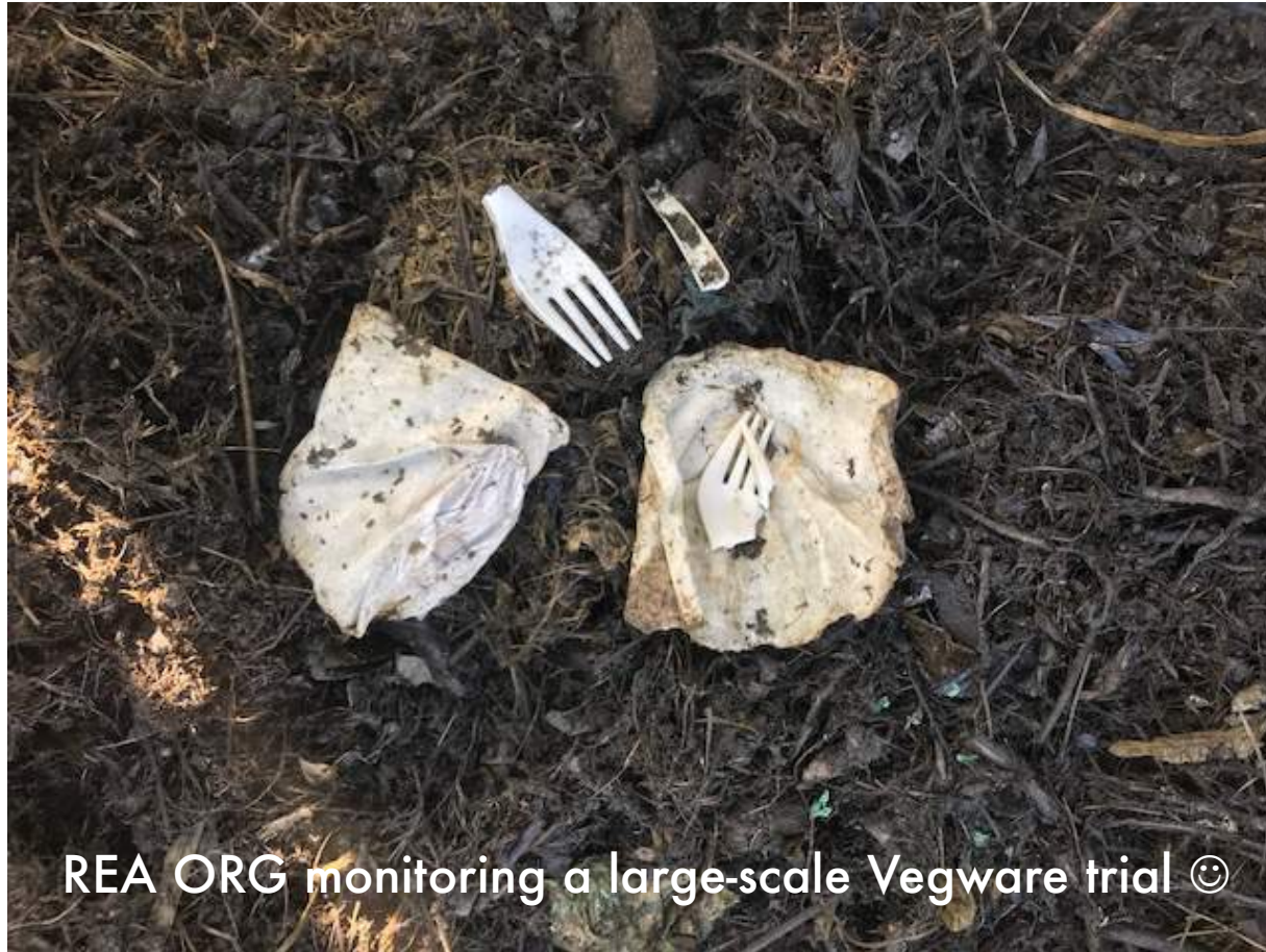
REA ORG monitoring a large-scale Vegware trial 😊

<<< After just 3 weeks at average temp of 72°C, only the cutlery is discernible (heat produced naturally by process)